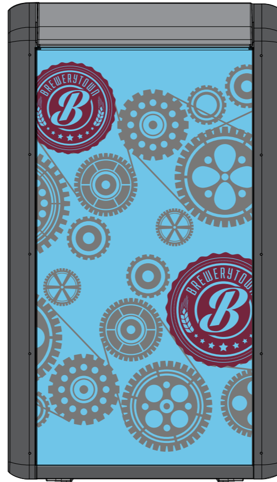
Rear / street-facing