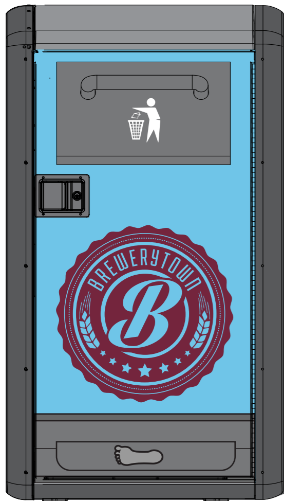
Front / sidewalk-facing

10309 SE 82nd Avenue, Suite C Tel: 503-777-2300 Happy Valley, OR 97086 Fax: 503-774-3622