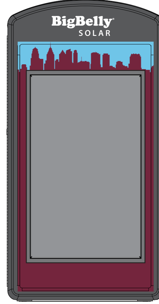
Side of Trash Bin